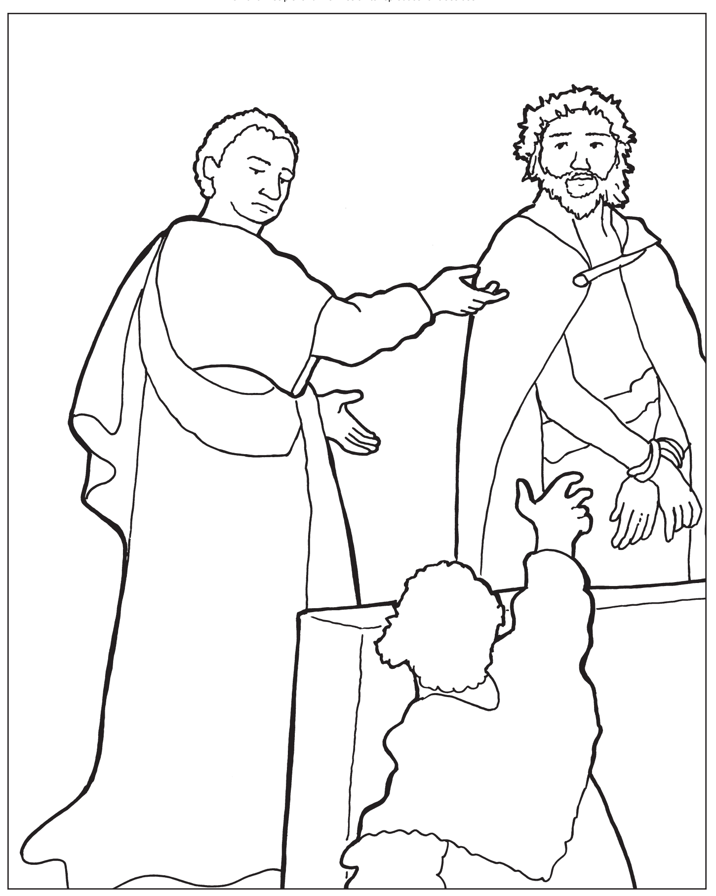
Pilate Judges Jesus