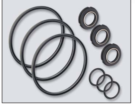
KIT 2: Casing Gaskets, Carbons, O-Rings