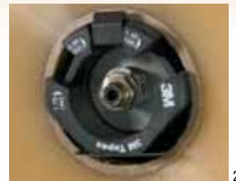
Tape drum latch secures roll for stability during tape application

More than fast, double buffing from the application and buffing rollers provides up to 90% tape wet-out for consistently reliable closure. And both rollers follow a curvilinear path with just the right touch to protect even lightweight cartons and fragile contents.