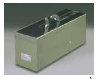
Scotch® Manual Filament Tape Box Sealer S634 applies L-clips as a package is slid across the sealer's top surface.

Product Use: User is responsible for determining whether the product is fit for a particular purpose and suitable for user's method of application.