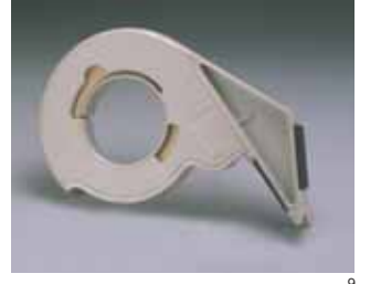
Scotch® Filament Tape Hand Dispenser H133 applies L-clips with one hand.